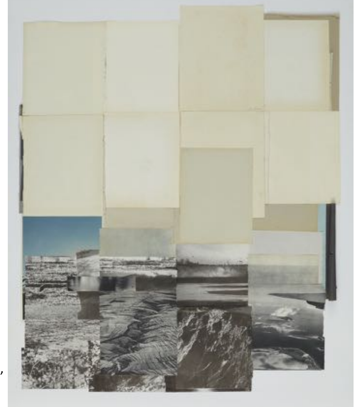
Dieuwke Spaans, Landscape