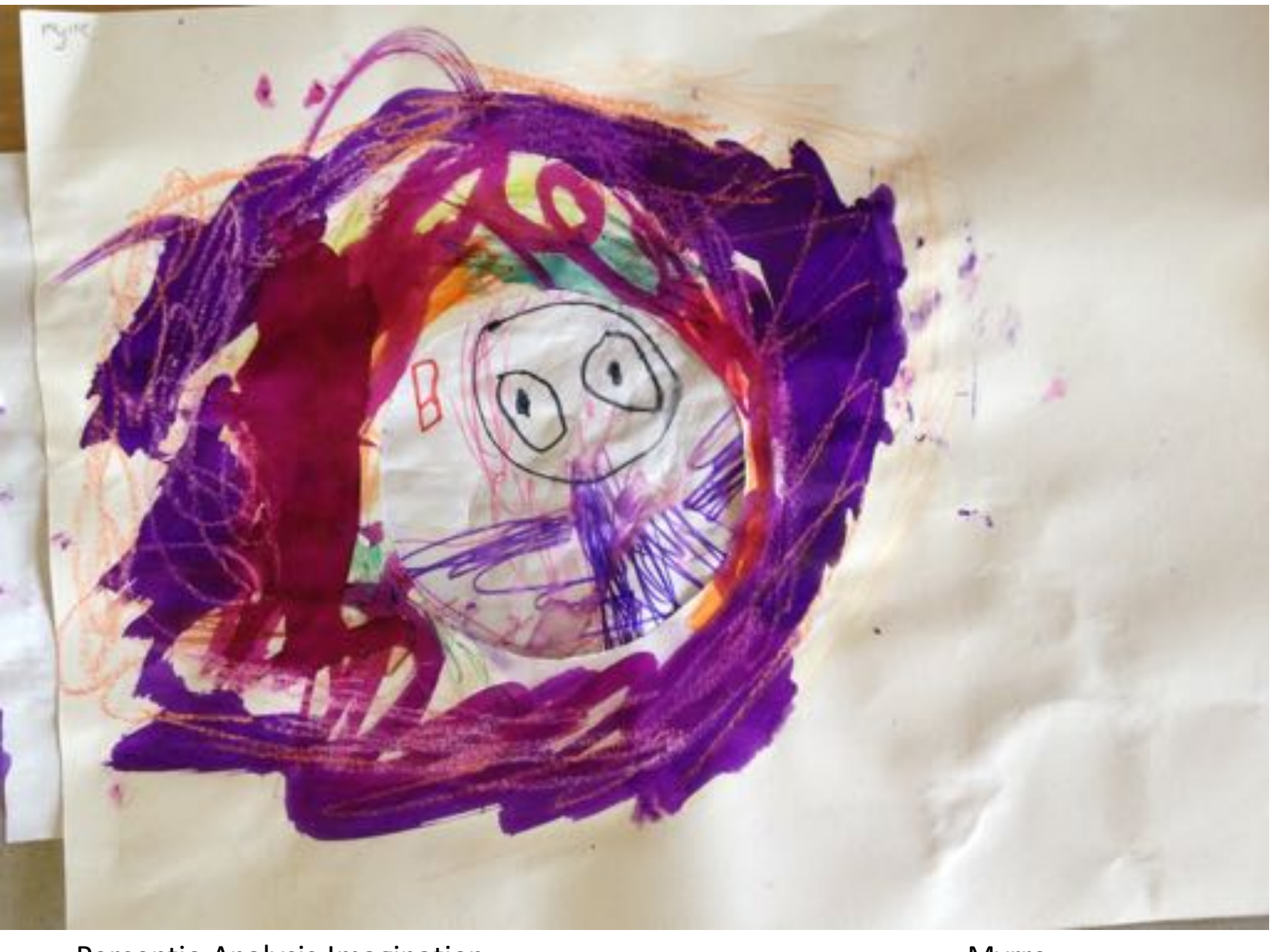
Perceptio Analysis Imagination