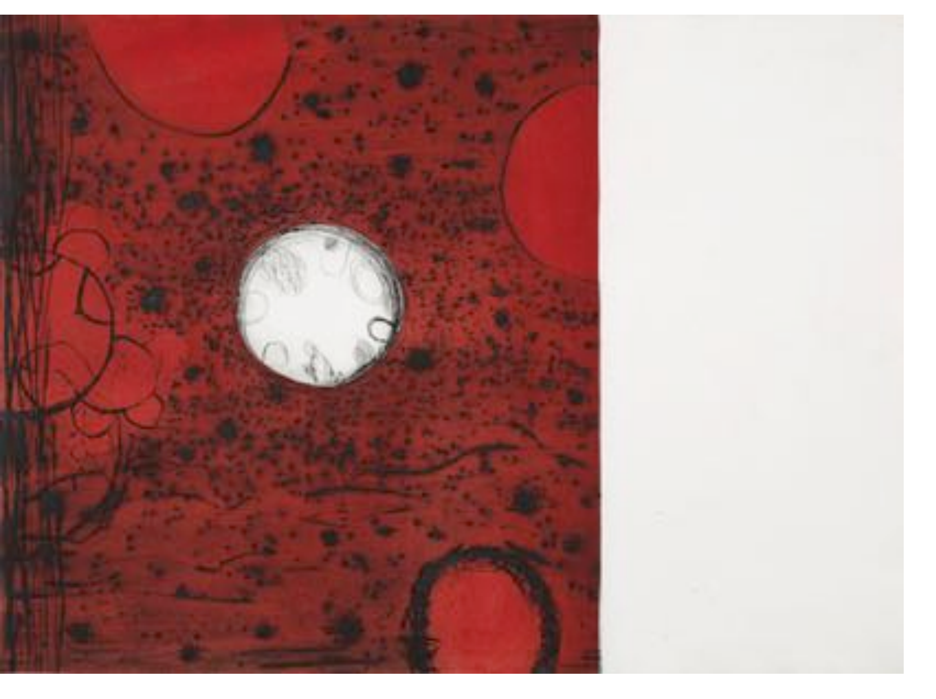
Kees de Goede, from the series Viva Mantegna , 1991