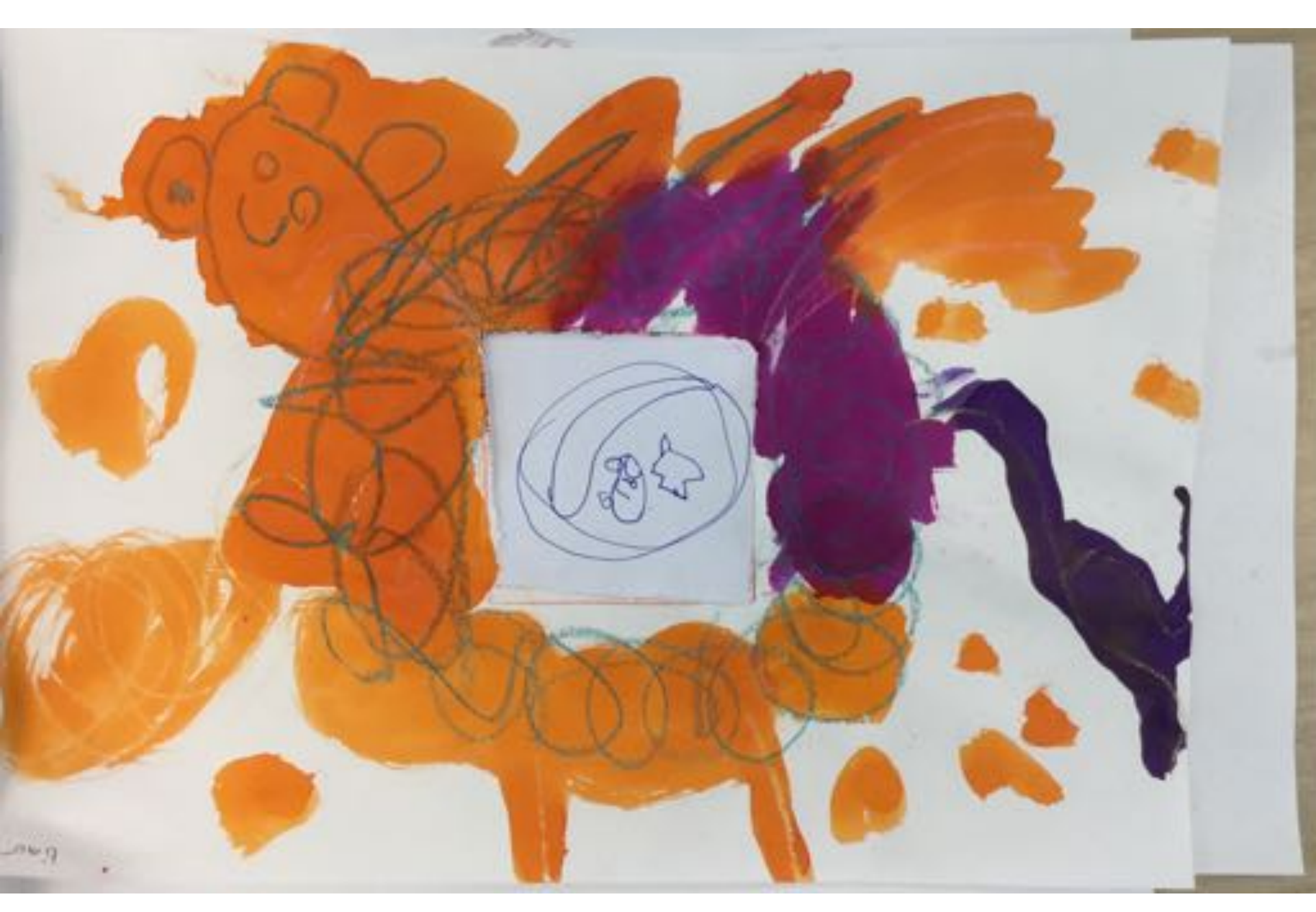
Perception Analysis Imagination