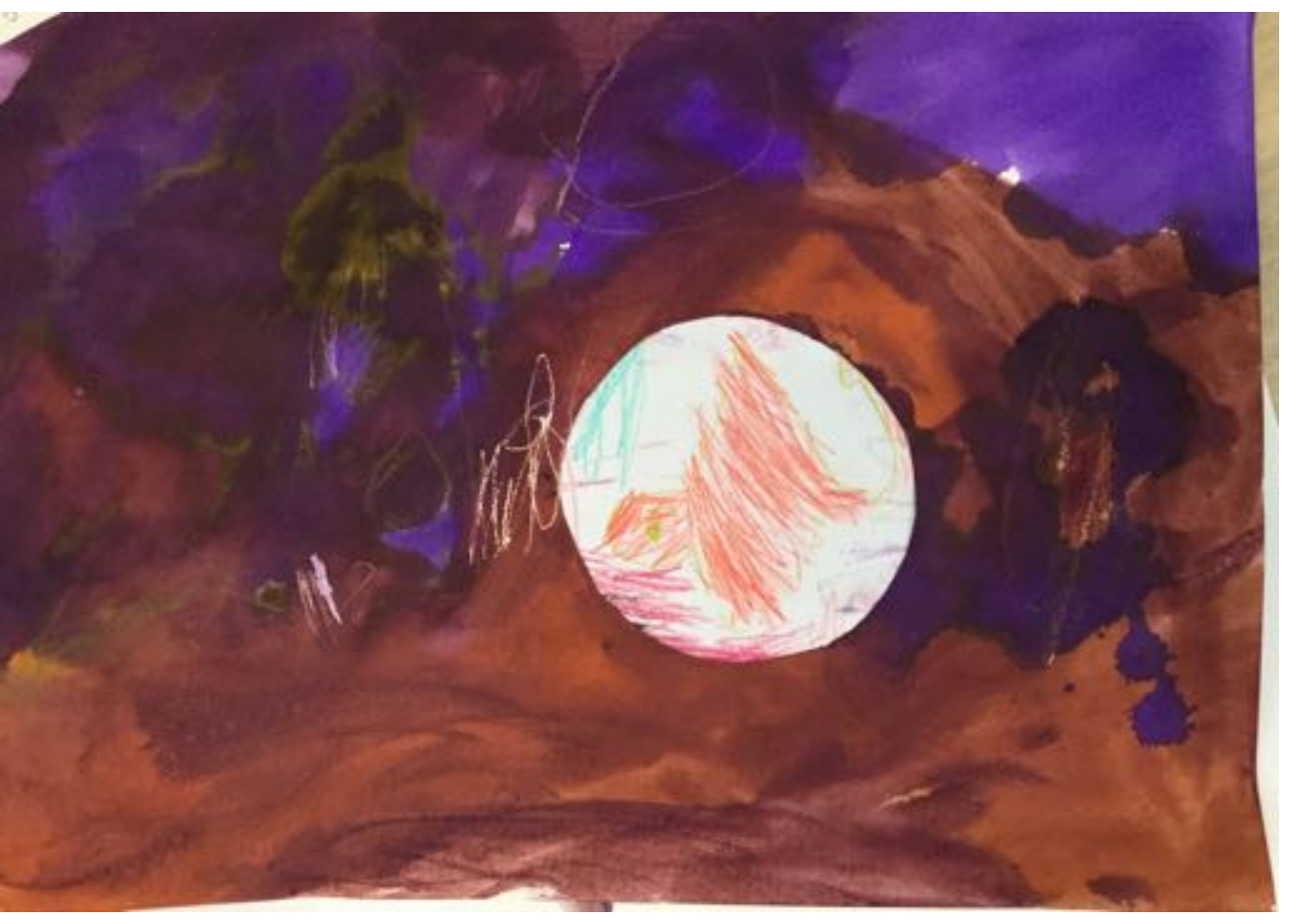
Perception Analysis Imagination